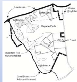
Site plans should clearly identify pre-existing features and resources